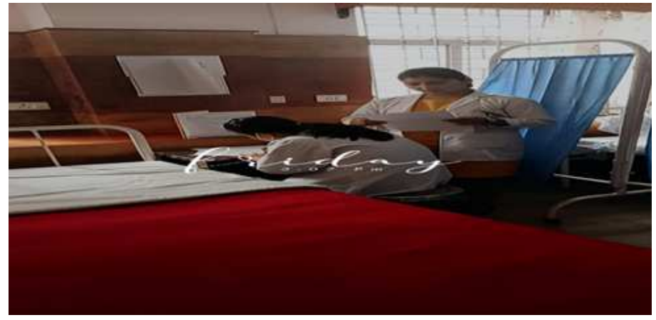
Figure 2: Focus on a Specific Skill.