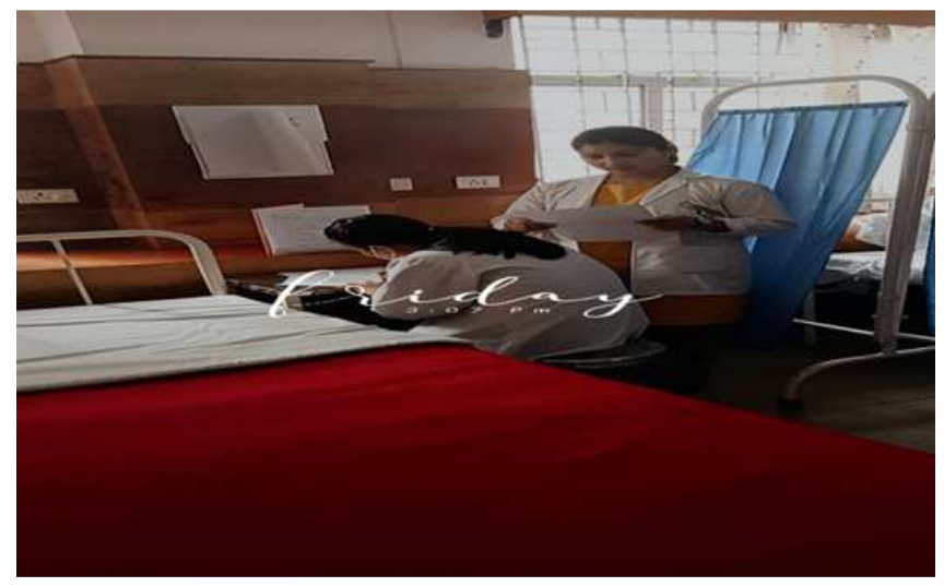
Figure 6: Controlled Environment.

Clinical activities / time / checklist developed (Figure 6)