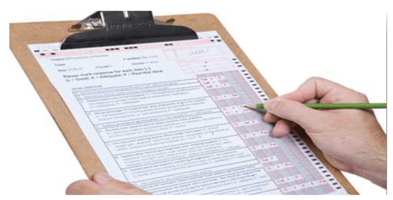
Figure 3: Focus on a Particular Skill.

Content verification and terms from expert (Figure 3)