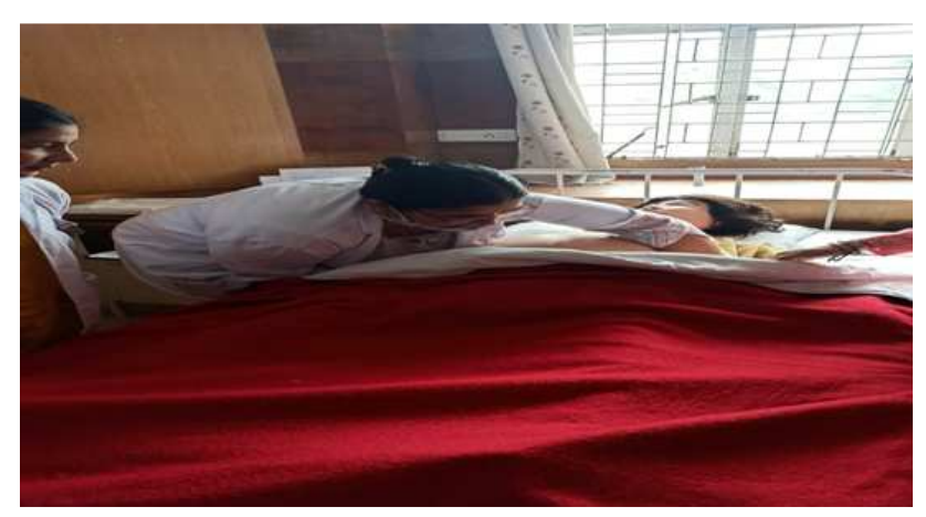
Figure 5: Emphasis on Hands-On.

Emphasis on what they do; rather than what they know (Figure 5)